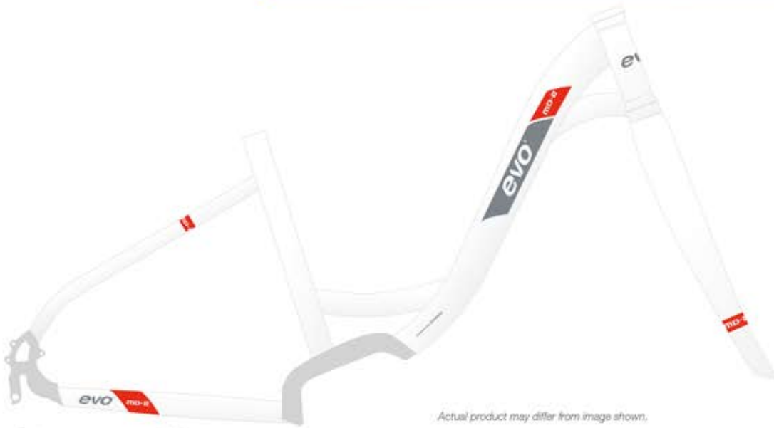
Actual product may differ from image shown.